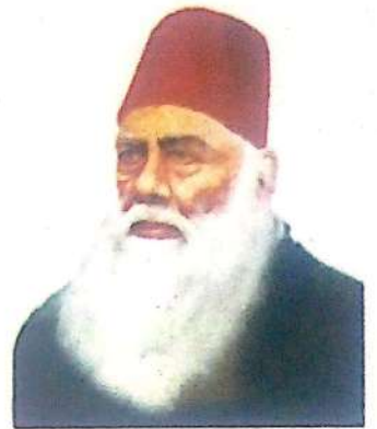
Sir Syed Ahmad Khan

After the British occupation of India, the person who first declared the Muslims a separate nation, was Sir Syed Ahmad Khan. Initially, Sir Syed Ahmad Khan was a supporter of the United Nationality but after the war of Independence 1857, when Hindus became closer to the British, Sir Syed realized that Hindus could never be friends of Muslims. On the eve of Urdu-Hindi conflict in Benares in 1867, he made a clear declaration that Muslims and Hindus were separate nations. After this, he started his struggle for development of the Muslims in educational and political fields. In this regard, the establishment of M.A.O High School and College was an important step in the development of education. Similarly, in 1885, Sir Syed Ahmad Khan protected the political rights of the Muslims by forbidding them from joining the political party, Congress. Sir Syed then paved the way for the political development of the Muslims by providing the platform of Muhammadan Educational Conference.