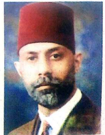
Chaudhry Rahmat Ali

Chaudhry Rahmat Ali was a renowned student of Islamia College Lahore. In January 1931, he entered Cambridge College for higher education in law. In 1933, he founded the Pakistan National Movement in London. On January 28, 1933, he released a four-page pamphlet entitled "Now or Never", which proved to be a strong support for Pakistan movement. Thus, alongwith the Muslims of the subcontinent, other nations also became familiar with the word "Pakistan".