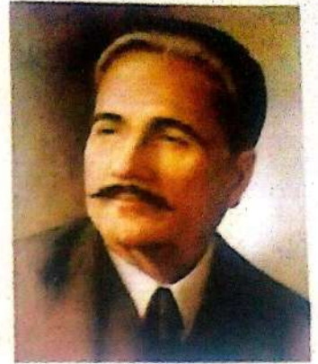
Allama Muhammad Iqbal رحمۃ اللہ علیہ

Allama Muhammad Iqbal رحمۃ اللہ علیہ was one of those Muslim leaders of the subcontinent, who gave the concept of a separate homeland to the Muslims and awakened them through his poetry. In the beginning he was also a supporter of the Hindu-Muslim unity, but soon the orthodox and biased attitude of the Hindus forced him to think that he should demand a separate state. In his Allahabad Address of 1930, he forcefully pleaded for a separate state where Muslims could lead their lives in accordance with their religion and culture. In his address he said:-